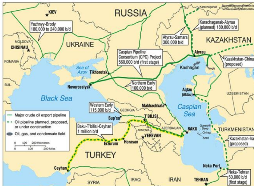
Caspian Sea Region Oil Pipelines